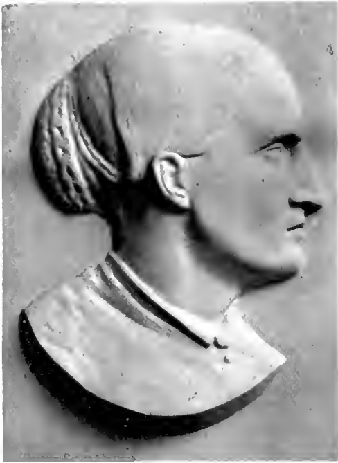
CAROLINE WELLS DALL.